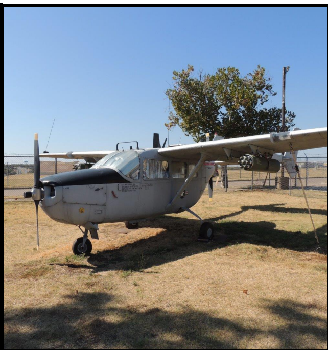
O-2A tail # 21430 at the Ft Worth Aviation Museum. Did any Rustics fly this bird?