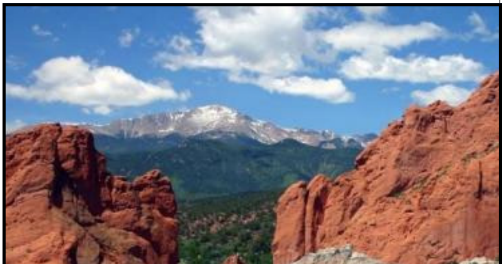
Pikes Peak towering behind the Garden of the Gods in Colorado