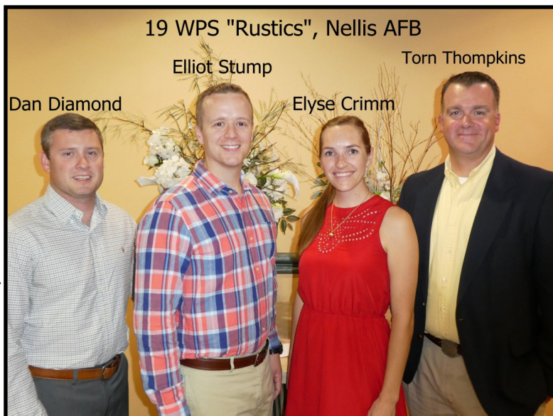
19 WPS "Rustics", Nellis AFB