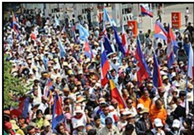
Anti-government protests supporting opposition party CNRP followed the 2013 general

A UN-backed war crimes tribunal, the Khmer Rouge Tribunal, sought to investigate crimes committed during the Democratic Kampuchea period and prosecute its leaders. Hun Sen has opposed extensive trials or investigations of former Khmer Rouge officials. In July 2010, Kang Kek Iew was the first Khmer Rouge member found guilty of war crimes and crimes against humanity in his role as the former commandant of the S21 extermination camp and he was sentenced to life in prison. In August 2014, the tribunal sentenced Khieu Samphan, the regime's 83-year-old former head of state, and Nuon Chea, its 88-year-old chief ideologue, to life in prison on war crimes charges for their role in the country's terror period in the 1970s.