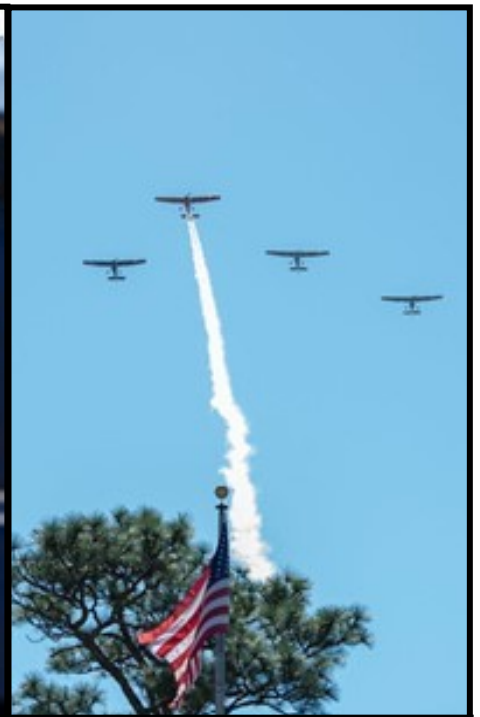
FAC Roll Call. Remembrance Service, Saturday, 26 Oct 2024