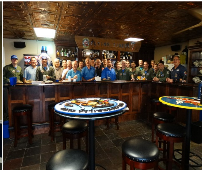
Flying Tigers and Rustics