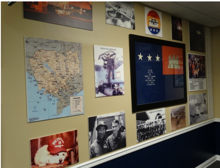
Rustic Memorabilia Wall